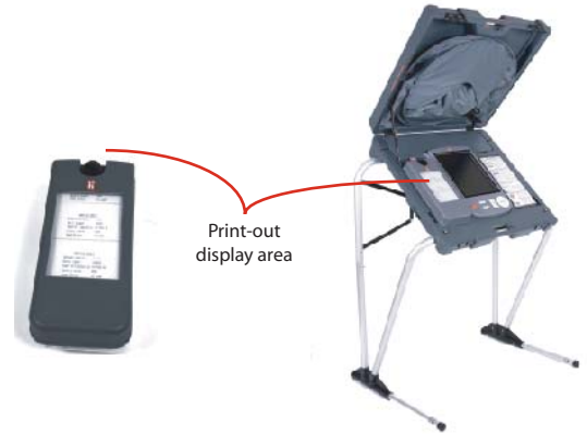
The voter verifiable unit easily fits into the eSlate® booth.

Hart InterCivic's commitment to integrity, our industry, and our customers, has led us to provide a Voter Verifiable Paper Audit Trail (VVPAT) version of our Hart Voting System for those jurisdictions affected by VVPAT legislation or regulations.