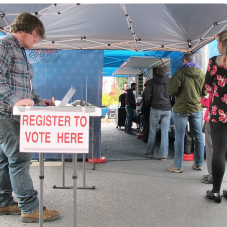
Idaho Power’s downtown Boise office is one of the sites that’s hosted the Ada County mobile voting trailer. Idaho is one of the states that has same-day voter registration.